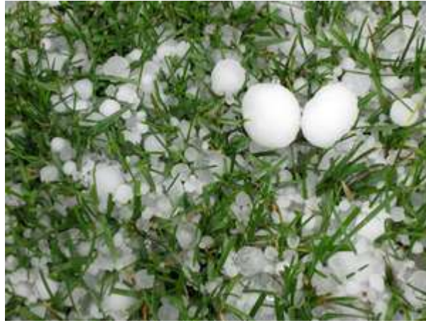
Hail stones from a storm in Colorado.

Hail stones are a frozen form of precipitation that occurs when thunderstorm updrafts lift rain above the freezing level in the atmosphere. When hail stones become too heavy to be lifted by the updraft, they fall to the ground.